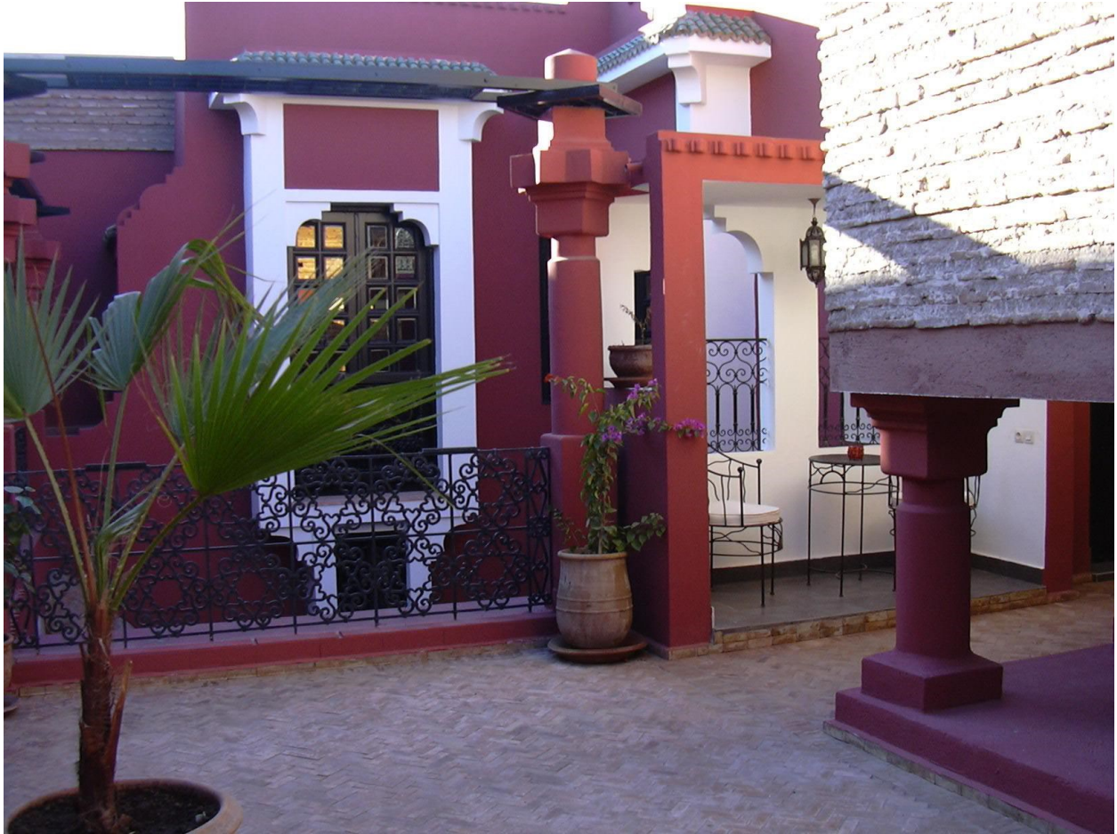
Detail of multi tiered roof terrace; consists of many intimate nooks.

How do you find the pics of this exclusive 200 year old architectural gem in the poshest part of the medieval Marrakech Medina?