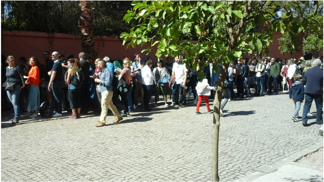
Cosmopolitan crowd waiting to get into the YSL museum and Majorelle Garden, Marrakech.