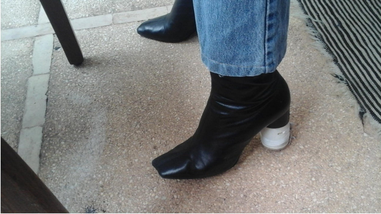
Marrakech Cutting edge style.