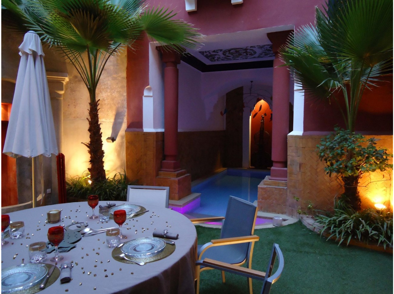
Dinner table set at poolside within courtyard.

How soon do you plan to book your dream Marrakech vacation?