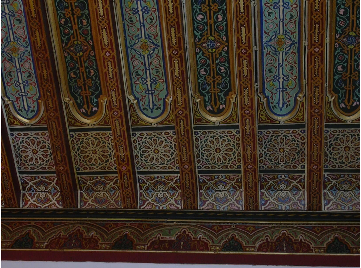
Restored 200 year old lounge ceiling. Cedar wood inlaid with precious metals....all hand done according to strict geometry by a master craftsman.