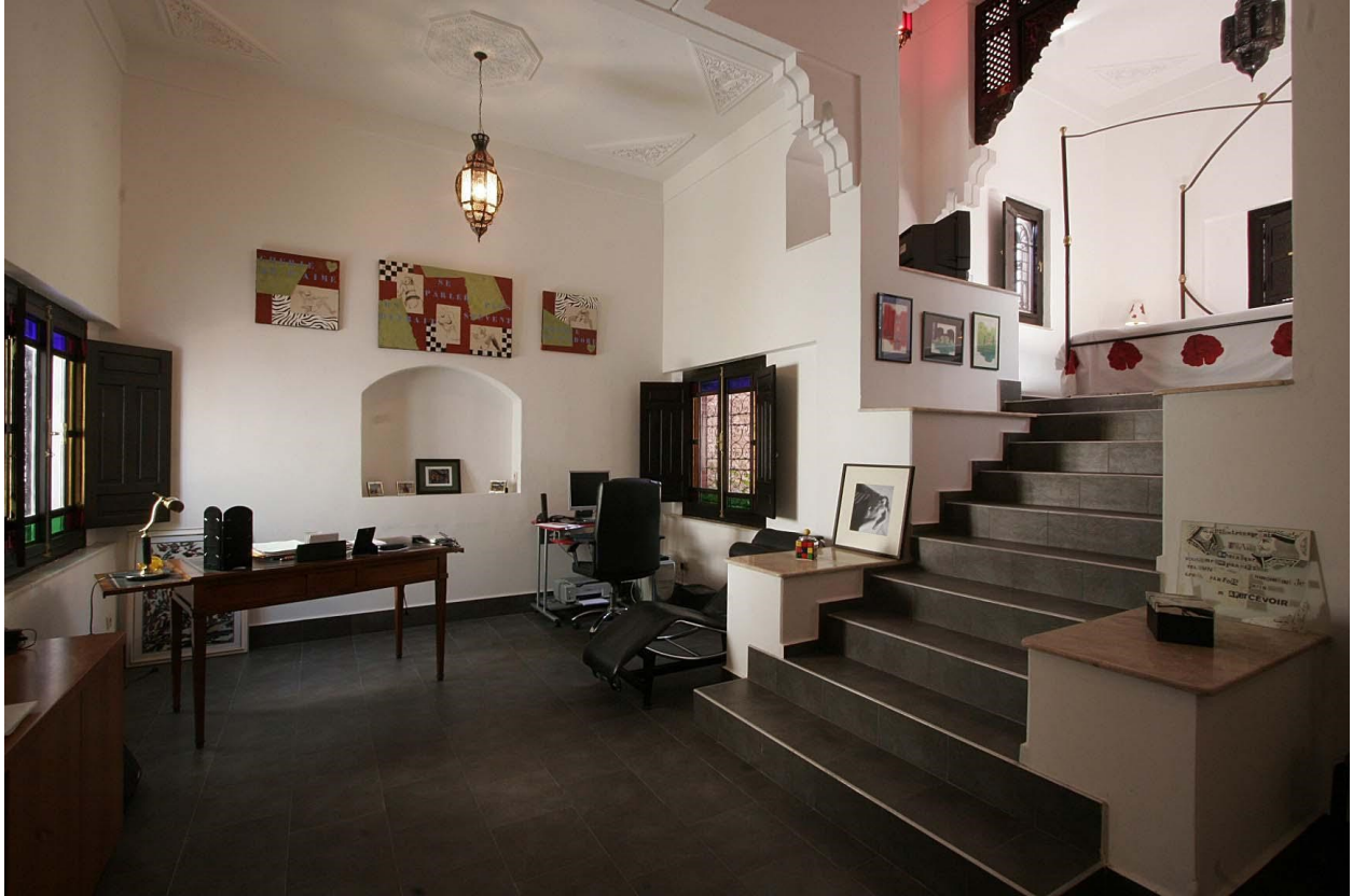
Bedroom with sleeping alcove, stained glass windows and archways.

Marrakech is a mythical place - steeped in history, with great architecture, high art and wonderful cuisine.