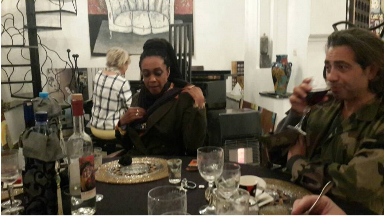
Dinner while being serenaded- a time to be savored.