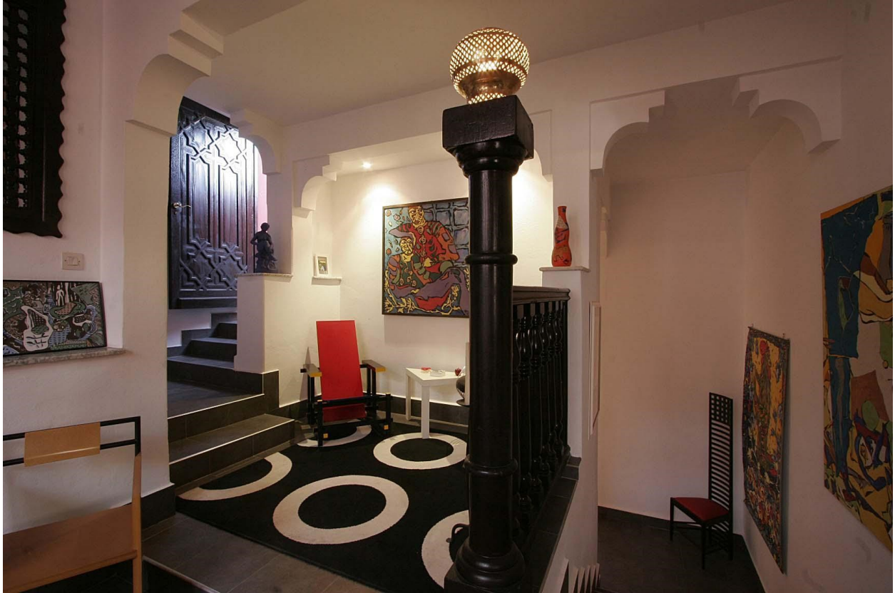
Living area with ancient columns, arches and mid 20th century classic furniture.

Its date palms, mature olive trees, fragrant flowers, nesting storks and nearby snow capped mountain peaks have excited travellers for over 1000 years.