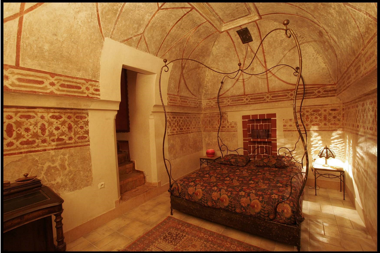
Bedroom; it is a converted 200 year old hammam with architect ails intact.

Hope you will book with your possé of BEAUTY FULL people for a dream vacation.....yeeeay!!!! ☐☐