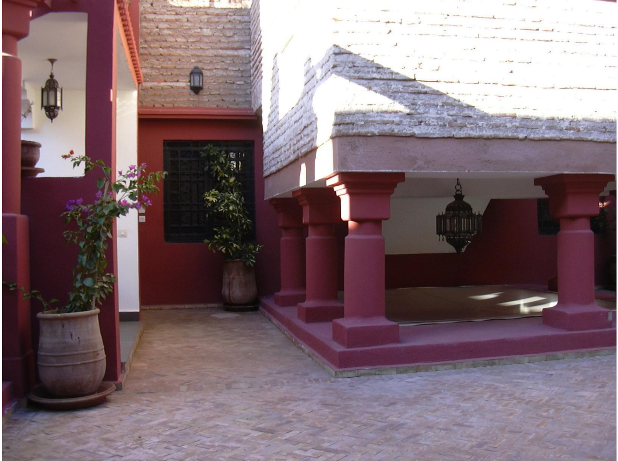
Details of multi tiered roof terrace garden; has 360° views of snow capped Atlas and 1000 year old Koutoubia Mosque.