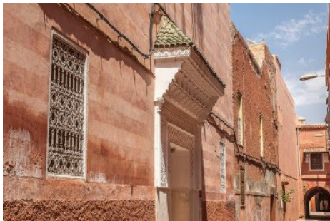
Medina shot; Riad Zitoun Jdid- a posh place.