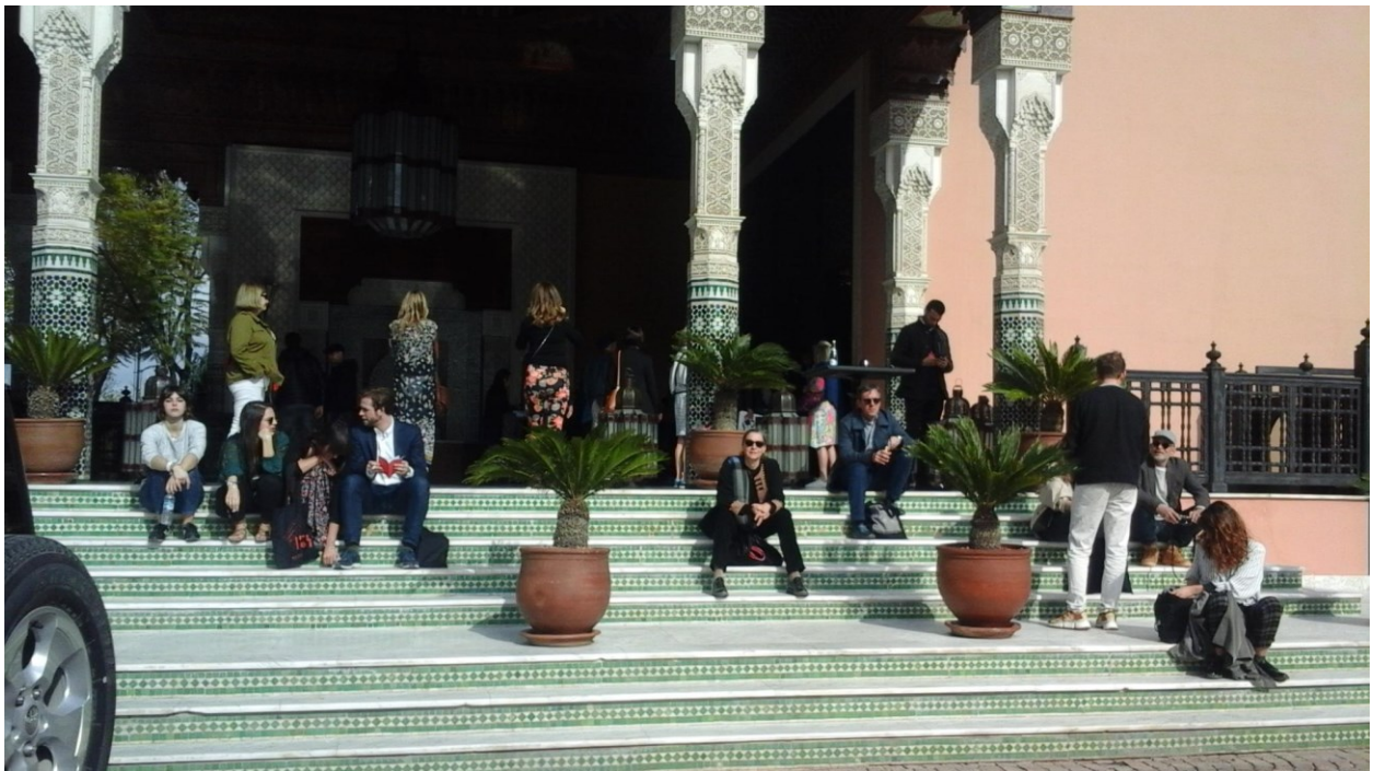
Basking in the sunshine at the 1:54 Fair.